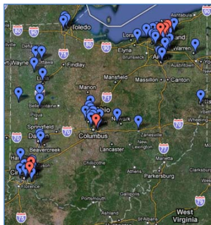
Figure 2 Map of Top Ohio Academic Schools - Click on Picture

A map with the locations of the 63 schools on the list is included below. The red markers indicate the top seven schools. The map hyperlink below goes to an interactive map. The Google Satellite button may be used to view schools in more detail from a "sky view" perspective. The Google Street View feature is available for many schools (by clicking on the "yellow figure"), and it provides yet another perspective.