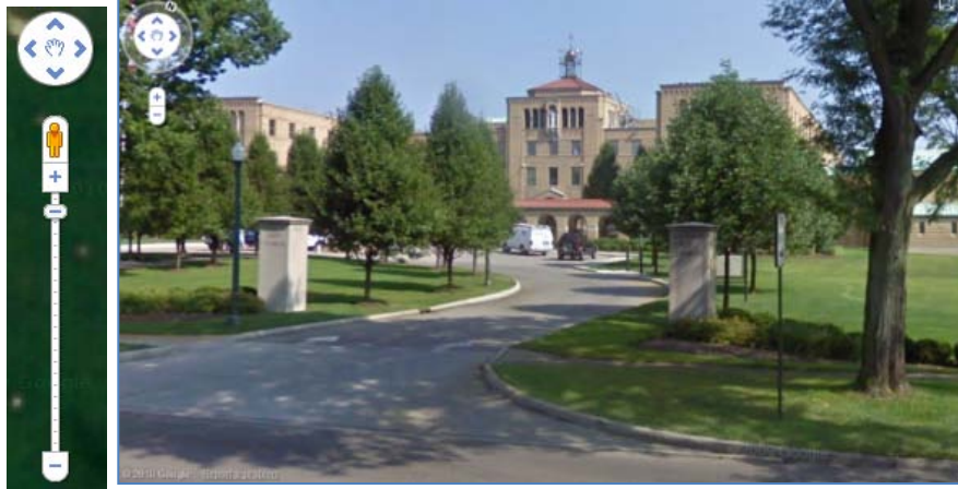
Figure 3 Street View of St. Charles Preparatory - Click on Picture